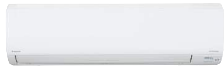
FTX18/24 Indoor Unit