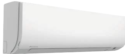
FTX09/12/15 Indoor Unit

Pushing the POWERFUL button on the remote control gives you a boost in cooling or heating power for a 20-minute period, even if the unit is already operating at high capacity.