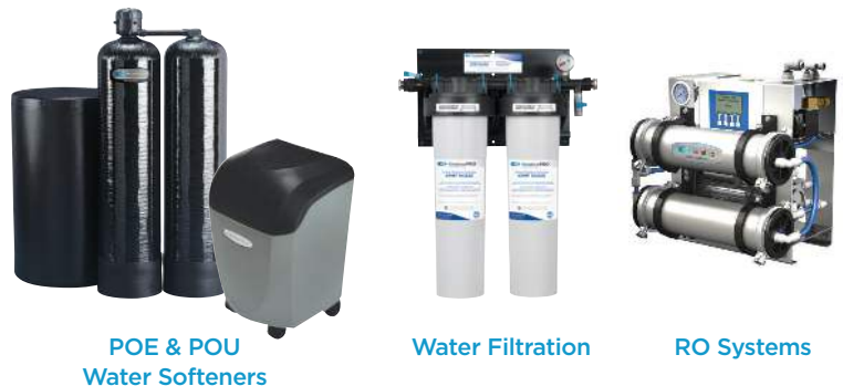
POE & POU Water Softeners

KineticoPRO® offers a complete range of commercial water treatment solutions. Based on a per-location water analysis, we will work with you to prescribe the ideal water filtration, softening, and reverse osmosis solutions to optimize your water quality and protect your equipment.