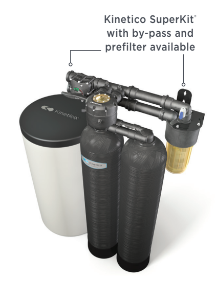
Model Shown: 2060s

Platinum 10 Year Limited Warranty: Enjoy years of dependability and peace of mind with one of the most comprehensive warranties in the industry.